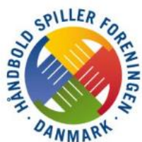
HSF (handball, Denmark)

The project started in February 2023 and will continue until January 2025. The project consortium is composed of ten members, with EU Athletes as the coordinator and Université Rennes 2 as the research partner. The following eight player associations, representing five major team sports and five European countries, are members in the project: