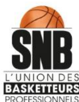
SNB (basketball, France)